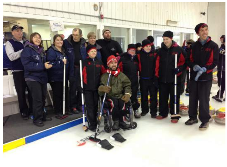
Powell River and Gibsons Curling Club