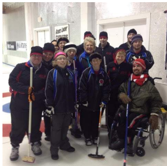
Langley and Gibsons Curling Club

A Special Olympics mini-Bonspiel was held November 5 th . Teams from as far away as Powell River and Langley participated in this event. Everyone had a wonderful time and the visitors were thrilled to receive Gibsons Curling Club pins.